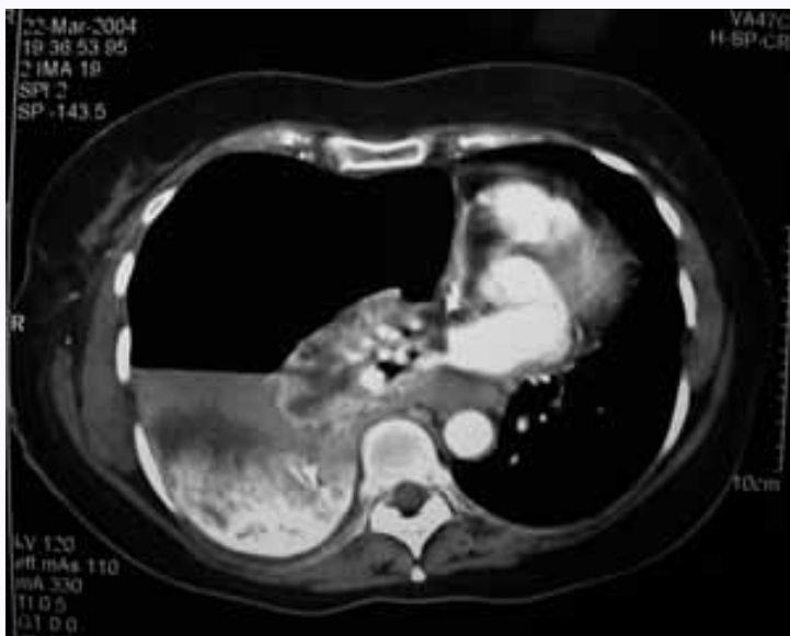
Fig. 2. CT scan shows contrast in the right pleural cavity. The collapsed lung and right hydropneumothorax can also be seen. A disadvantage with CT scanning is localising the oesophageal tear.

laparotomy was performed. A perforated duodenal ulcer, which in retrospect seems to be the reason for her epigastric pain and vomiting even at initial presentation, was found and a primary repair was done with simultaneous insertion of a jejunostomy feeding tube. This necessitated a long in-patient stay and after 8 weeks she remained stable. The right lung had completely re expanded. There is a small residual right pleural effusion. Unfortunately healing of the oesophageal tear remained unsatisfactory and repeat Gastrografin swallows demonstrated the persistence of a 12 mm tear communicating with the right pleural cavity. She had a gastrojejunal feeding tube inserted in a tertiary care centre and was managed