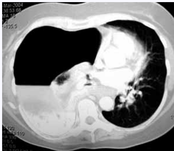
Fig. 3. A further CT image.

conservatively with periodic Gastrograffin swallows. Healing was slow and she was referred to another tertiary centre for consideration of a repair. A repeat swallow that was done at the end of August showed that the oesophagus had mended and the feeding tube was ultimately removed in October. She remains well at the time this report was submitted.