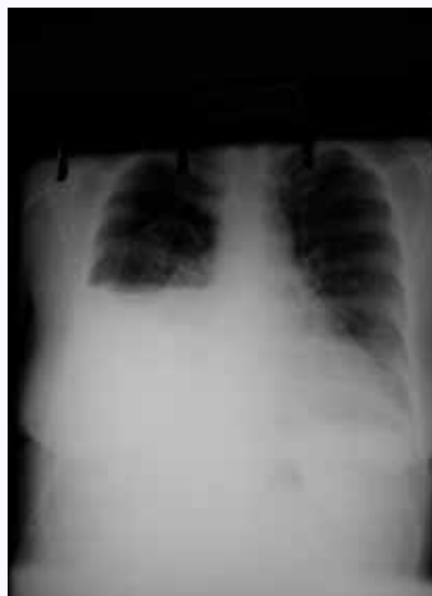
Fig. 1. Hydropneumothorax with a large bore chest drain in situ. No pneumo-mediastinum evident. No V-sign of Naclerio (present in 20% of cases), which consists of radioluscent streaks of air that dissect the fascial planes behind the heart to form the shape of the letter V. It is a specific although insensitive radiographic sign.